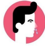
Running Nose / Nasal Congestion