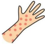
Rashes on hands & feet