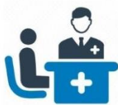
Consult a Doctor