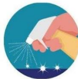
Clean and disinfect