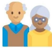
Adults above 65 years