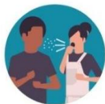
Avoid close contact with sick people