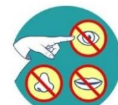
Avoid touching your eyes, nose, and mouth.