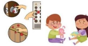
Contaminated surfaces and objects