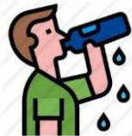
Drink Plenty of Liquids