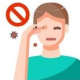
Avoid touching eyes, nose, and mouth