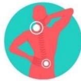
Muscle or body aches