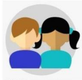
Children under Age 5