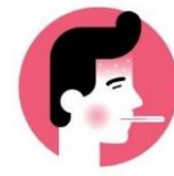
Fever/ Feverish chills