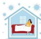
Stay home if you are sick with symptoms of HFMD