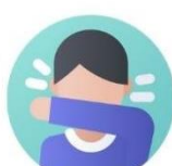
Cover coughs/ sneezes