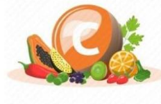
Intake Vitamin C Rich Food