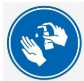
Hand washing /Hand sanitisation