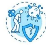
People with weak Immune System